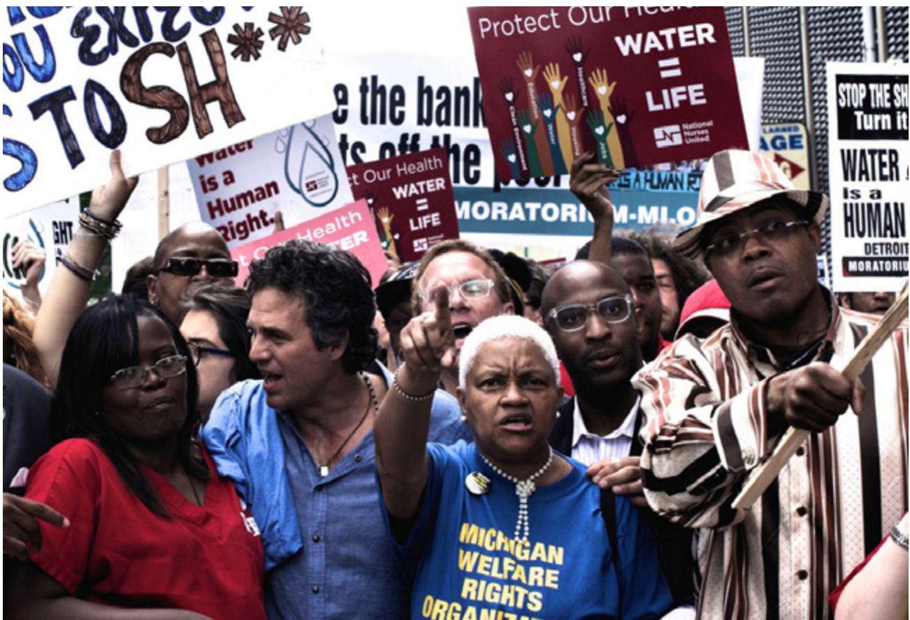
Actor Mark Ruffalo joins local Detroit residents at a rally demanding affordable access to clean water.