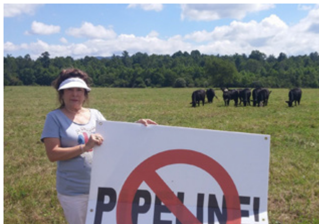
Pipeline impacts would be significant—local elected officials have raised concerns of risks to local drinking water supplies.