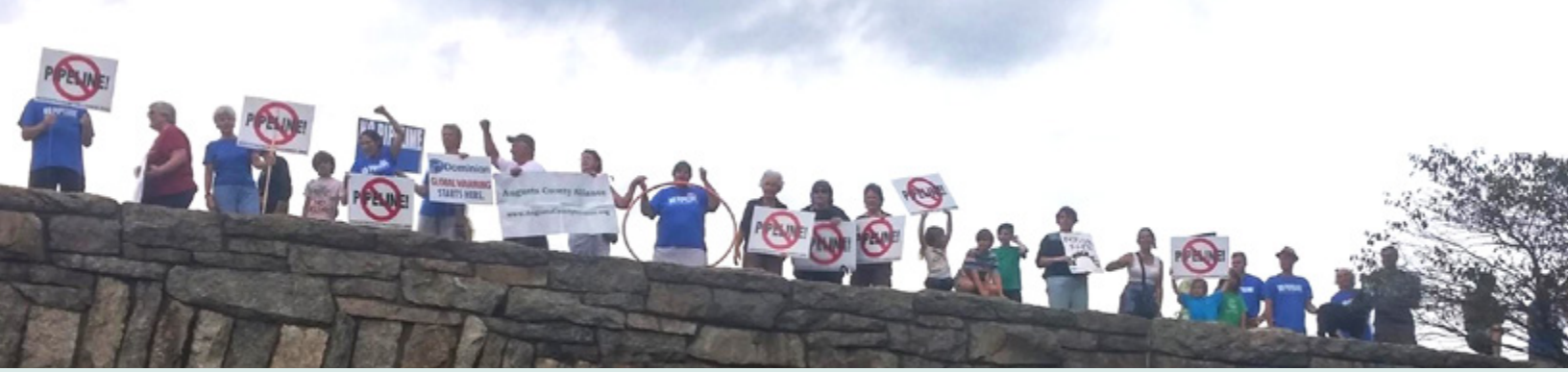
Community members turn out for “Hands Across the Land”, an event to highlight the extraordinary views from the Blue Ridge Parkway and Appalachian Trail at risk from the Atlantic Coast Pipeline.