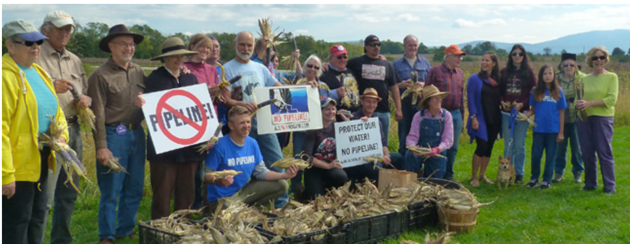
Communities’ support for clean water, property rights and their traditional agricultural heritage are fueling opposition to the Atlantic Coast Pipeline across the Shenandoah Valley.