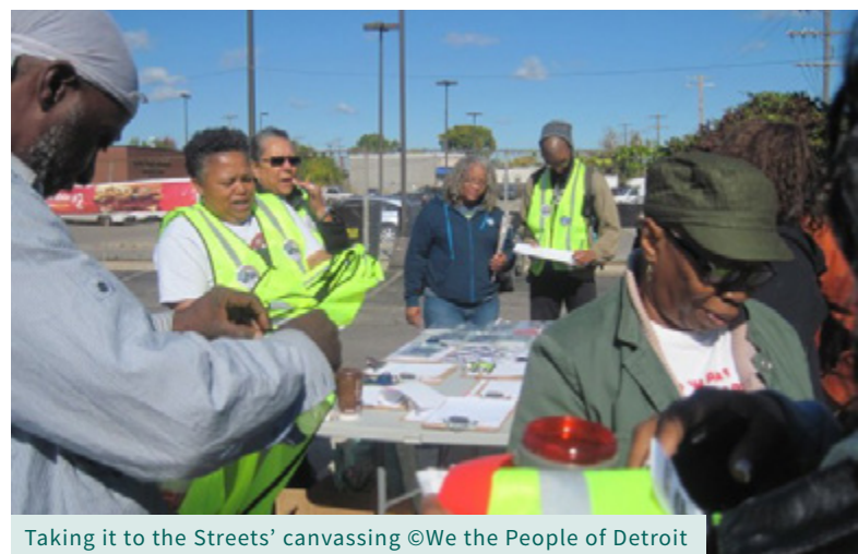
Taking it to the Streets' canvassing

Our volunteers continue to conduct door-to-door canvassing and distribute "Water=Life" kicker cards. We also manage a water rights hotline for people who need emergency assistance, oversee Water Stations, and on an emergency basis, even deliver water to folks who cannot make it to a station.