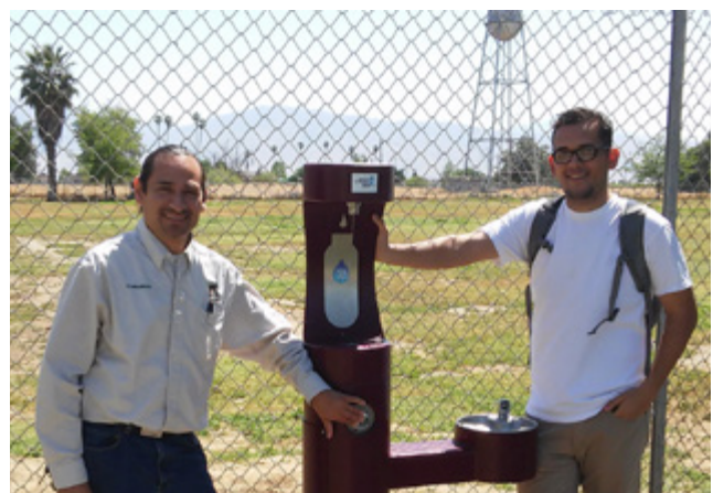
CWC works alongside community leaders to advance both interim and lasting drinking water solutions.