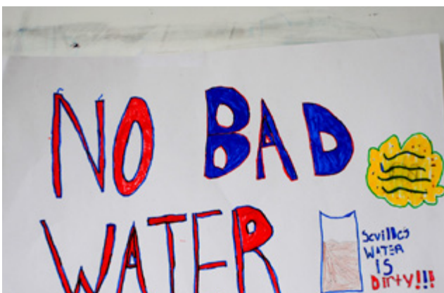
A child's plea to a visiting representative of the UN Human Rights Council who visited Seville, CA in 2011 to evaluate the community's water system.