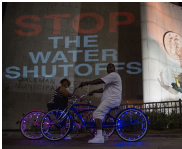
The “STOP the Water Shutoffs” message has become a common sight across the city of Detroit.