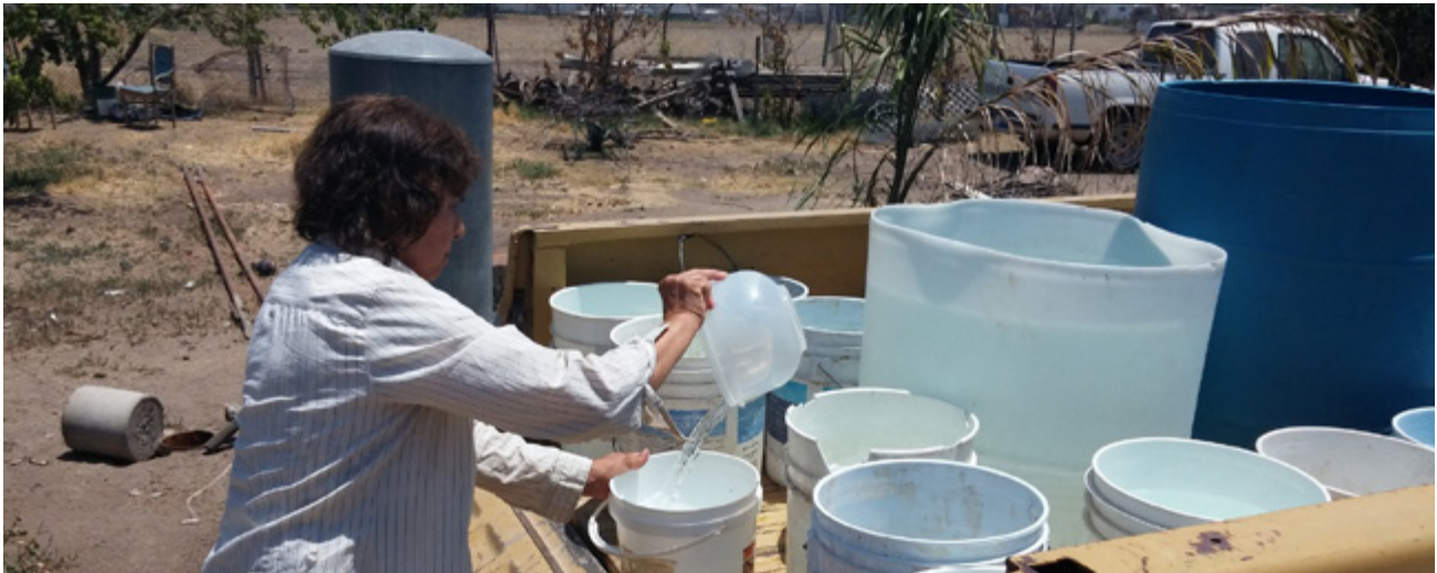
Thousands of residents completely lost their household water supply during the recent drought and lived out of bottles, buckets, and tanks. Some homes still remain without running water even after a record wet winter.

We have made a lot of progress together with communities since our founding ten years ago, but too many Californians are still dealing with unsafe, unaffordable, or unreliable water. Despite increased investment in community drinking water projects, many communities are still waiting for solutions.