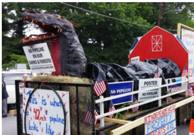
Local property rights advocates oppose the pipeline on the basis of the misuse of eminent domain powers for private gain.